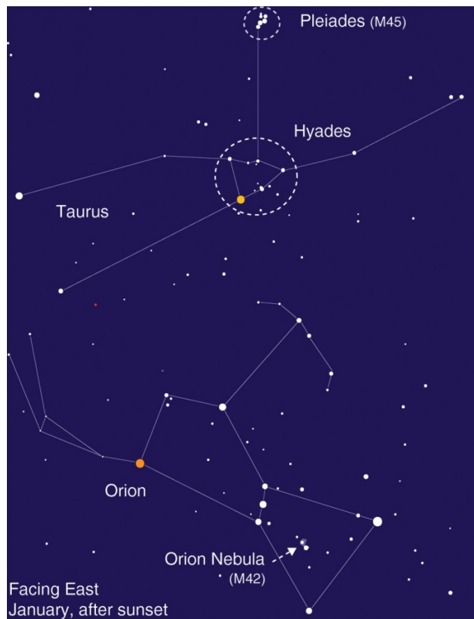
Caption: Locate Orion rising in the east after sunset to find the Orion Nebula in the “Sword,” below the famous “Belt” of three bright stars. Then, look above Orion to find both the Hyades and the Pleiades. Binoculars will bring out lots of extra stars and details in all three objects, but you can even spot them with your unaided eye!