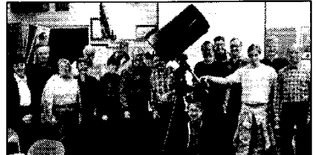
AAI members gather around the Celestron CM 1400 destined for the Jenny Jump Observatory during the First Light ceremonies.